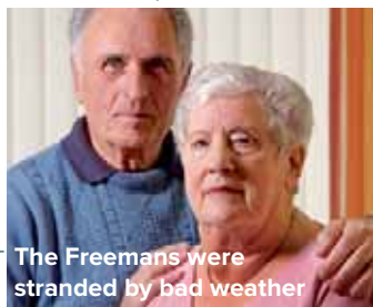
The Freemans were stranded by bad weather

The airline doesn't have to pay extra compensation beyond this as the flight was cancelled because of 'extraordinary circumstances'. Your