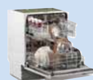
70% Electrolux ESL6115 £405