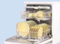
71% Miele G 1232 SC £641