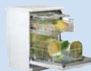
77% Miele G 1220 SC £474