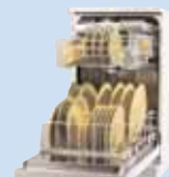
71% Miele G 1102 SC £535