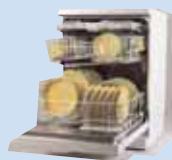
71% Miele G 1222 SC £580