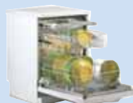
78% Miele G 1230 SC £620

Here are six other Best Buys, all tested in the past two years. Miele dominates with five full-sized and slimline models, while Electrolux has a great built-in. Go to www.which.co.uk/dishwashers for details.