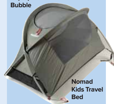
Nomad Kids Travel Bed