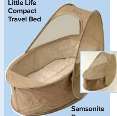
Samsonite Pop-up Travel Cot Deluxe