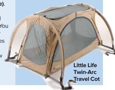
Little Life Twin-Arc Travel Cot