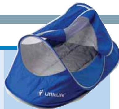
Little Life Compact Travel Bed

We found that tent-style travel cots are the hardest to use of all those we looked at. They are also more expensive. We tested the Nomad Kids Travel Bed (£80 online) and Little Life Twin-Arc Travel Cot (£80 online) . They take up more floor space than a normal travel cot and are hard to erect. You really need two people for this and threading the poles can be time-consuming. Little Life tells us it has now made the poles slightly smaller on its cot to make putting it up easier.