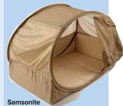
Samsonite Pop-up Bubble