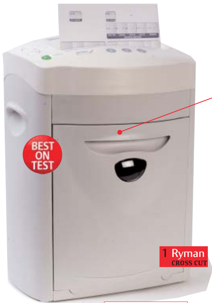
1 Ryman CROSS CUT

The Fellowes (4) and the GBC (5) aren't as durable as the Best Buys, but are worth considering if you have only small amounts to shred.