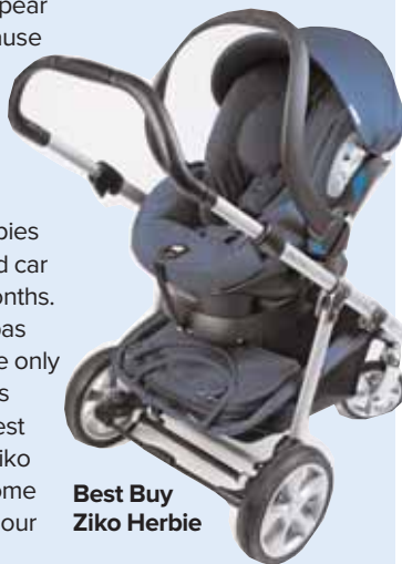
Best Buy Ziko Herbie

2007 tests that match pushchairs. The Best Buy Maxi Cosi Cabrio seat is compatible with a wide range, including two Best Buys – the Bugaboo Bee and Quinny Speedi SX. The Best Buy Recaro Young Profi Plus is part of the Best Buy Maclaren Techno XLR travel system. Go to www.which.co.uk/pushchairs and www.which.co.uk/childseats for more.