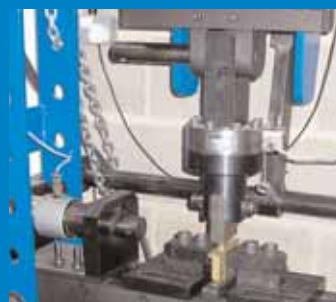
A peep through the keyhole at our lock-testing secrets

Expect to spend between £70 and £150 to have your lock fitted, depending on location.