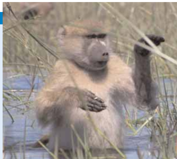
Watch BBC programmes, such as Planet Earth , in HD

A More than 130 digital TV, regional TV, radio and interactive channels are available. Freesat says this will rise to around 200 channels by the end of the year. Listings include most of the familiar digital channels from the BBC, ITV and Channel 4, plus a few less familiar names, like the Movies4Men film channel. However, some content is missing, like the History Channel and even Five. For a full list, see www.which.co.uk/freesat .