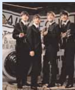
Freesat: no history shows