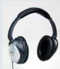
BOSE QUIETCOMFORT2 £225

These two types of set stole the show when we tested headphones in August 2006, and the good news is that all our Best Buys are still available