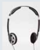
SENNHEISER PX 100 £30

The lightest and cheapest of the on-ear Best Buys. Sound is clear and bright with good bass.