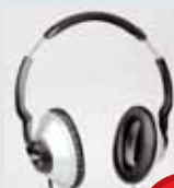
BOSE TRIPORT £99

A great option for use with portable players, they are surprisingly lightweight and sound is good.