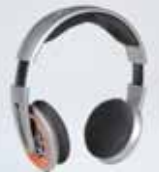
SENNHEISER HD 435 £45

This bulky set gives dynamic, well-balanced sound and the headband is easily adjusted.