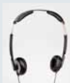
SENNHEISER PXC 250 £100

Ideal for commuters, these headphones fold up and a noise-reduction feature helps shut out the outside world.