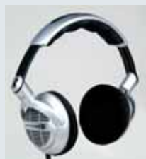
BEYERDYNAMIC DTX900 £50

The dynamic sound of these over-ear headphones is clear and balanced, though they are heavier than our other Best Buys.