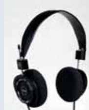
GRADO SR60 £80

They may look basic but this Grado set offers superb sound that is rich and well balanced. However, they struggle to prevent sound escaping and to keep out unwanted noise.