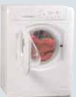
55% HOTPOINT WML520 AQUARIUS £269

Compared with the rest, this Hotpoint is an inferior cleaner, though results are still passable. Program times are fairly short, and the spin is variable with a maximum of 1400RPM – the quickest of the bunch.