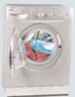
62% BEKO WM5120W £200

Cleaning is good on both the easy care and cotton washes. The cotton wash is quick at one hour and 40 minutes, but this machine lacks extras like a variable spin speed, delayed start and handwash program.