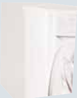
63% INDESIT WIB111 £197

The highest scoring of the bunch, this Bosch is great for washing cottons and doesn't use a lot of water. Its spin leaves clothes less damp than most of the other bestsellers here, but the easy-care wash could be better.