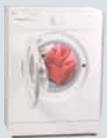
61% BEKO WM5100W £180

This machine washes well on both programs in our test. The easy-care program is a little long at one hour and 41 minutes, and although the easy-care rinse is good, the cotton rinse could be better.