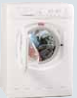
58% HOTPOINT WML540 AQUARIUS £280

This Beko impresses on cottons, but at two hours and 22 minutes it's a long program. The easy-care wash is very good too, but a bit of an energy and water sapper. The rinse is good on both programs.