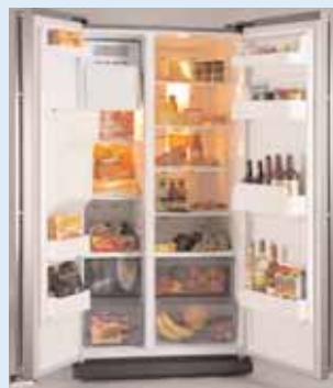
69% Samsung RSH1DTMH £800

This Bosch is pricey at £1,200 and while it looks great, we found the freezer to be a bit small. An icemaker reduces storage space to 109 litres. Changes in room temperature don't affect this model. We found that the recommended freezer temperature setting was a little out in our test. You'll need to play with the thermostat to get it right.