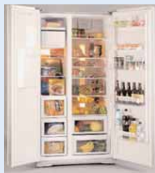
68% Beko AP930 £750

The Samsung comes with some good extra features. As well as the standard water dispenser and icemaker, there is an accurate digital thermometer and visible and audible high-temperature and open-door alarms. The 291-litre fridge cools food in eight hours. And the 117-litre freezer stays frozen for more than 18 hours in a power cut.