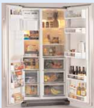
70% Bosch KAN58A40GB £1,200

you're feeling the financial pinch at the moment, you may be better off visiting www.which.co.uk/reviews/fridge-freezers for a range of cheaper Best Buy fridge-freezers.