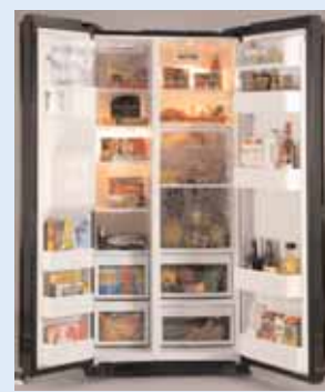
62% LG GWL227YBQA £900

This has the largest internal volume of all four models. The 325-litre fridge compartment cools food in seven hours, while the 134-litre freezer can freeze 13kg in 24 hours – good for this type of fridge-freezer. The recommended temperature setting is a little out – you may need to change the initial setting. Fluctuations in room temperature don't affect this model.