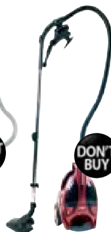
14 Vax CYLINDER