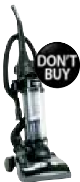
24 Vax UPRIGHT