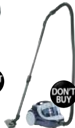
15 Panasonic CYLINDER