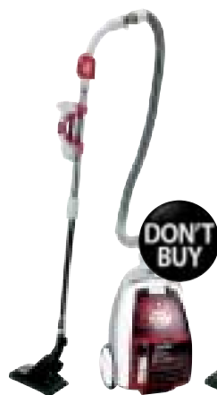
10 Hoover CYLINDER