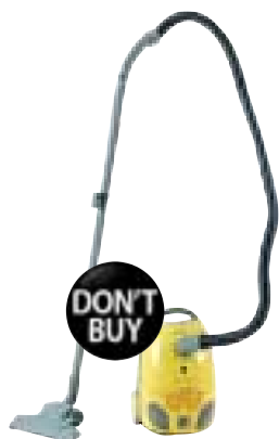
17 Proline CYLINDER