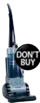
22 Panasonic UPRIGHT