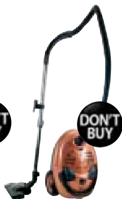
12 Dirt Devil CYLINDER