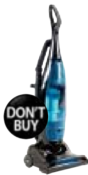
23 Proaction UPRIGHT