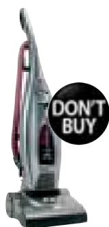
25 Morphy Richards UPRIGHT