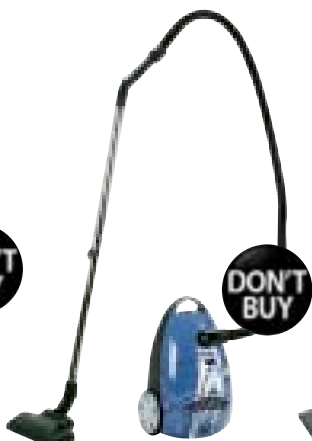
11 Morphy Richards CYLINDER