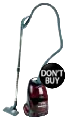
16 Goblin CYLINDER