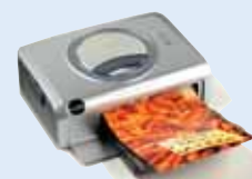
60 Photo printers