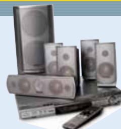
44 Home cinema