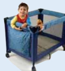
64 Travel cots