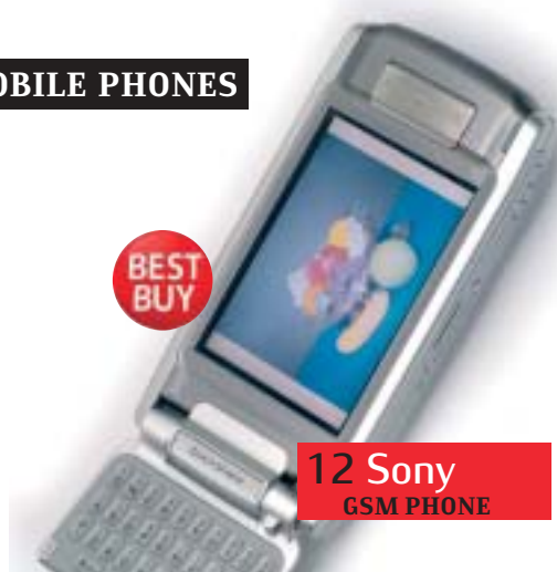
12 Sony GSM PHONE