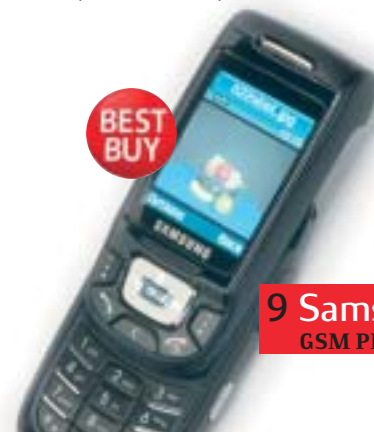
9 Samsung GSM PHONE

The Z107 comes with stereo earphones which help to improve the sound on video calling. One unusual but welcome feature is that it also comes with two batteries (one with longer life than the other), and a separate charging station. This means you can use the phone with one battery while your spare battery is being charged. There's no Bluetooth, but it comes with a USB cable to allow you to transfer photos from phone to computer.