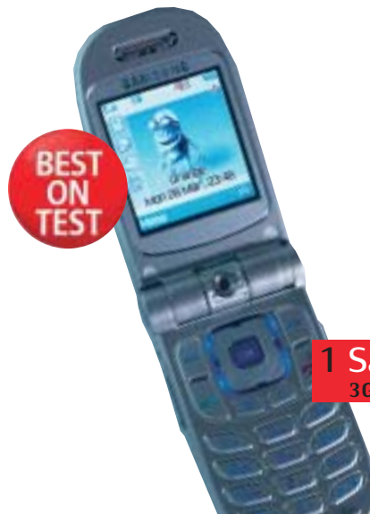
1 Samsung 3G PHONE

None of our non-Best Buys is a bad phone, but each of these models is let down by one aspect or another. For example, some models are less easy to use or, in the case of the fashionable Motorola (26), durability is not brilliant. We put several samples of this particular model through our (admittedly tough) drop tests and one of them fell to bits, while another's screen was damaged. So, if you own one of these phones, remember to treat it gently.