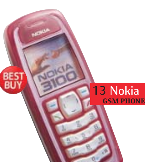
13 Nokia GSM PHONE

The touchscreen Sony Ericsson P910i is an update of a previous Best Buy, the P900. It operates with a stylus and can be used as a personal digital assistant, as it has various office functions, such as contacts and task management and a small Qwerty keyboard on the inner side of its small cover. All these functions add to the weight – it's a hefty 159 grams – but, that aside, it performs well as a phone as it's easy to use with good sound quality. And it's great for texting. Bluetooth connectivity is good, and there's a 32MB memory card for storing extra information, such as music and photos. The camera takes good pictures for a mobile phone.