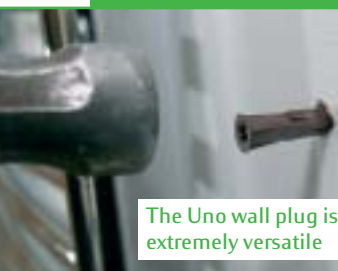
The Uno wall plug is extremely versatile

Wall plugs are essential when screwing anything to a wall or ceiling, but there's a confusing array available. The Uno (£2.80 for a pack of 48 6mm plugs) claims to be the only one you'll ever need as it works in a variety of materials. It expands along its entire length as the screw is inserted,