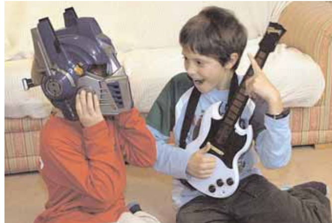
Two young testers try out some of the toys

Talking parrots and dragonflies are among the expected big sellers. But which are the best?