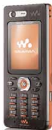
Highly rated – the Sony W880i

Something simpler is the Nokia 6085 (2) . It's an inexpensive but durable clam-shell, offering excellent battery life and fine sound quality. Handily, it's also quad-band so it can be used anywhere in the world, and it comes with an MP3 player and FM radio. There are limitations, as the camera is basic and the headset supplied is mono – but it's a good choice if all you're after is a phone for calling and texting.