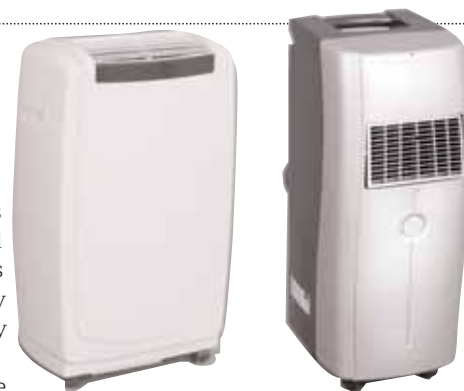
New air conditioners rise to the challenge: the 414/0021 is pictured left, the 415/0602 right

We were also impressed by the Challenge 415/0602 – a steal at £190 and scoring 70 per cent. This model is slimline so is a good choice if you're concerned about space. But although it's designed for smaller rooms, it still manages a high cooling rate. And its budget price tag doesn't exclude handy features, such as the remote control, timer and indicator lights featured in its larger companion.