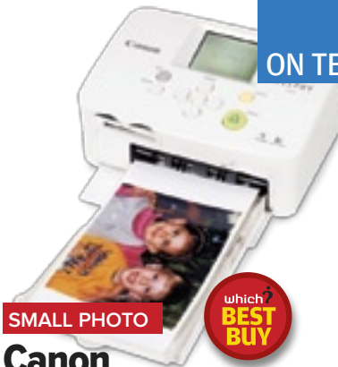
Photo printing from memory card No Connectivity Wi-Fi, Ethernet and USB Cheapest at Staples Also available Online

Full review at www.which.co.uk/BrotherHL2170W