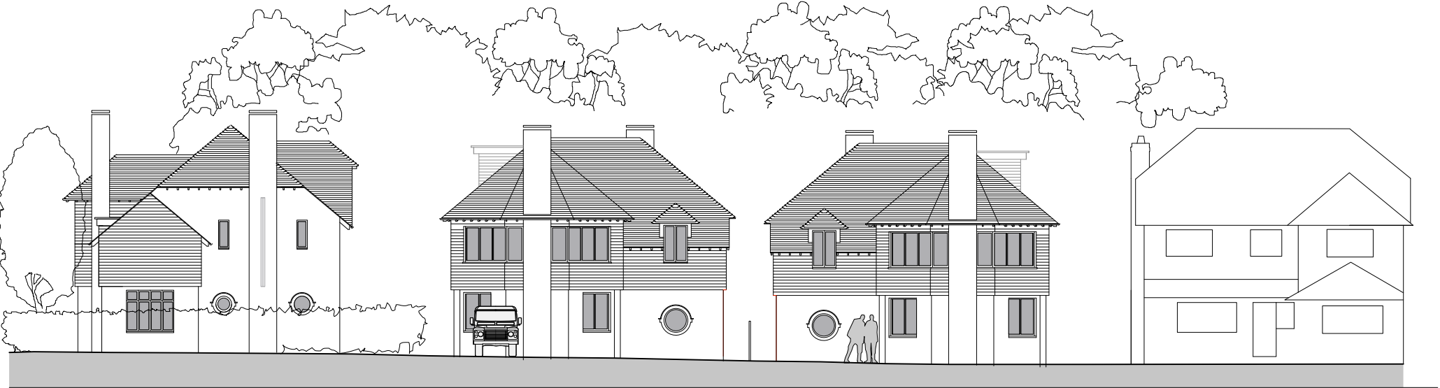
proposed elevation to Southview Road

CLIVE DAVIS 137 HARROWDENE GARDENS TEDDINGTON TW11 0DN 07766 912382 info@clivedavisarchitect.co.uk project Beech Hill Stores redevelopment drawing Existing and proposed street scenes drawing number GU35 8HU TP06 scale 1:200 at A2 date JUL 2021 revision