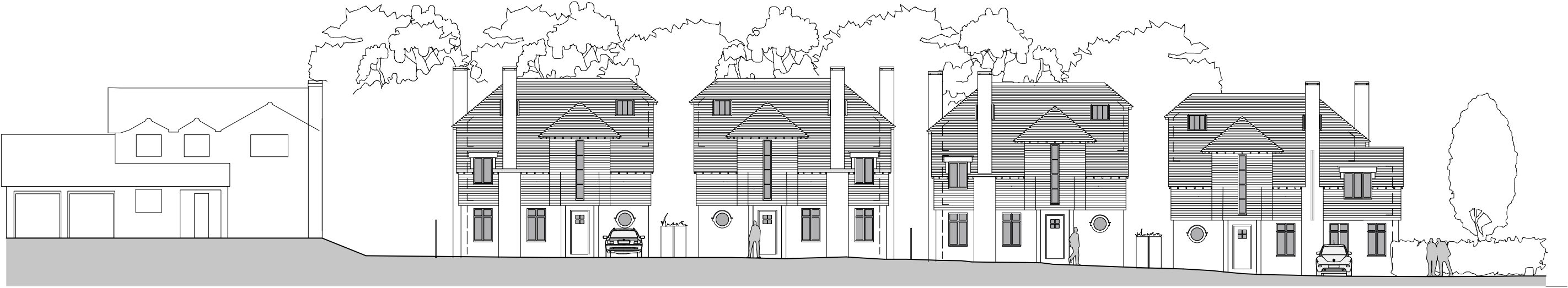
proposed elevation to Eddey's Lane