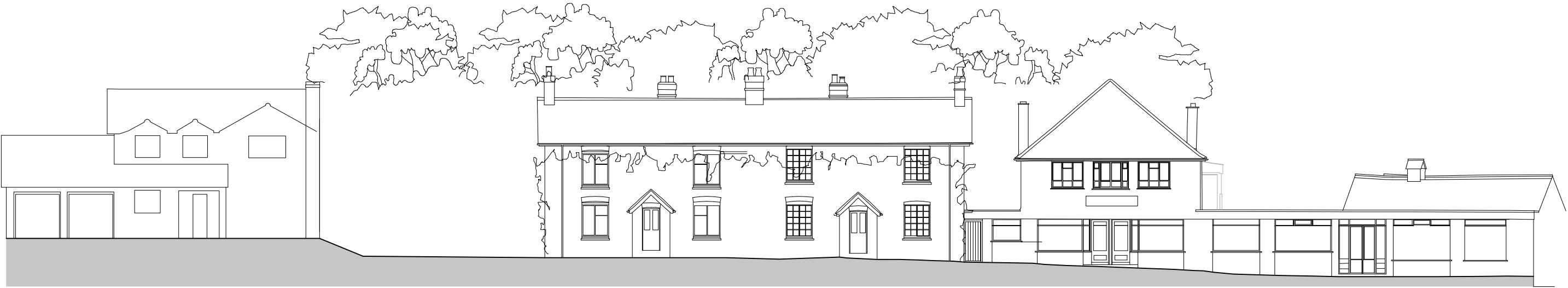
existing elevation to Eddey's Lane